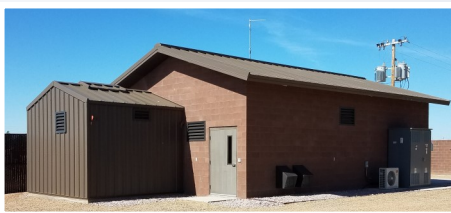
Secured Well Housing

Groundwater is the sole source of potable water in the City of Prescott. The City produces its water from seven production wells within the Prescott Active Management Area (AMA). These wells are drilled into the confined deep Lower Volcanic Unit of the aquifer underlying the Little Chino Sub-Basin. The water is pumped from the ground through one of the City's seven active wells and treated prior to entering the drinking water distribution system. The water is of excellent quality and the City's production capabilities are sustainable. The wells are pumped in different combinations to meet daily demand. The City's annual average daily demand is 6.67 MGD. In 2020, Prescott produced (pumped) 7,480 acre-feet of water from the wells and delivered this water to approximately 25,448 service connections through 563 miles of pipeline, 37 remote booster pump stations and 26 water storage tanks throughout the service area.