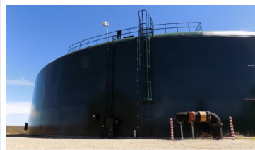
Water Storage Tank