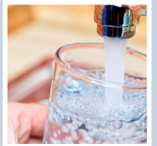
Clean Water To Your Tap