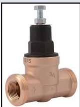
Pressure Regulator Valve

WATER PRESSURE: The most common question regarding water is about a change in water pressure to the house. Low water pressure to the home can be caused by many things: Mineral deposit build-up can reduce the flow in domestic pipes and faucet aerators may become plugged if not regularly cleaned and maintained. If a water heater is not regularly maintained per factory specifications, the inside can degrade causing pieces of scale, minerals and particulates to dislodge and migrate through a home's water system. Another common cause of water pressure concerns can be related to the setting of a water pressure regulator valve (PRV). A PRV factory setting is 50 PSI. A previous homeowner may have adjusted the PRV setting to limit the pressure of water delivered from the municipal supply line. A failing PRV can cause low or high water pressure. It is important to understand that a PRV is a mechanical device that can fail over time or on occasion be defective directly