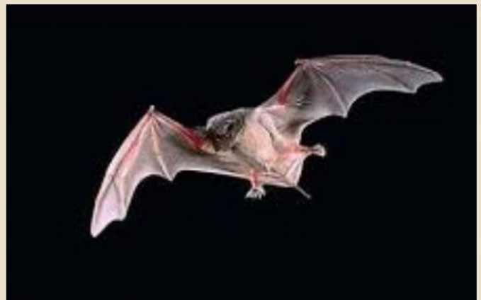
Pictured is a Mexican Free Tailed bat (right) and skeleton. A colony numbering over 100 resided at Mile High Middle School.