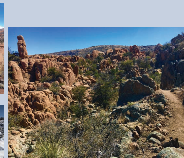
Easter Island Trail