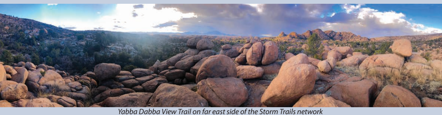
Yabba Dabba View Trail on far east side of the Storm Trails network

distance: many options available access: multiple trailheads - see below parking: Peavine Trailhead $3 (free on Wednesdays) The 160 acres containing the Storm Trails was purchased by the City of Prescott in January 2018, in February 2018 trail design and construction started. The trails showcase balanced rocks, boulder fields and impressive view of the Dells, Glassford Hill, Watson Lake and Granite Mountain. The Easter Island Trail, pictured below, is named after the striking rock formations. The first entrance is about 1 1/3 miles down the Peavine from the trailhead on Sundog Ranch Rd.