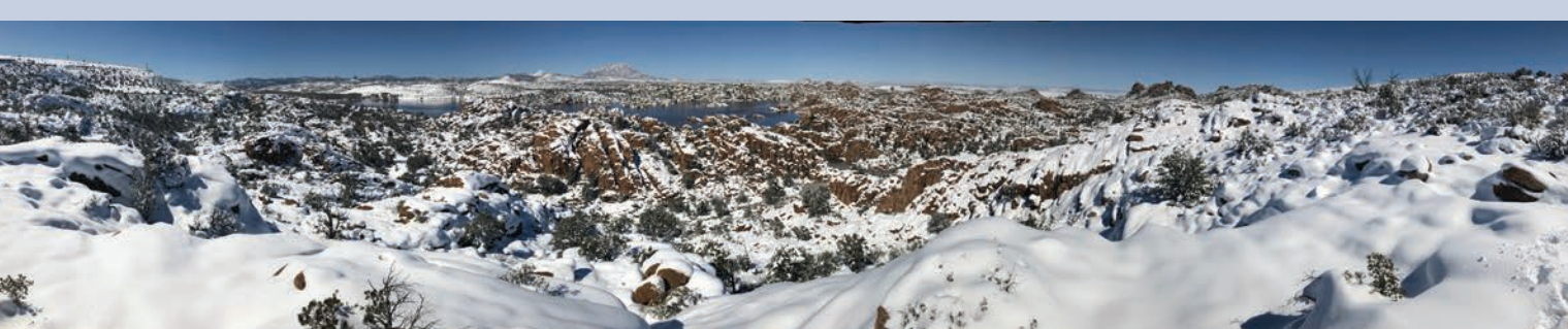
Panoramic view from Captain's Trail with Watson Lake in the background