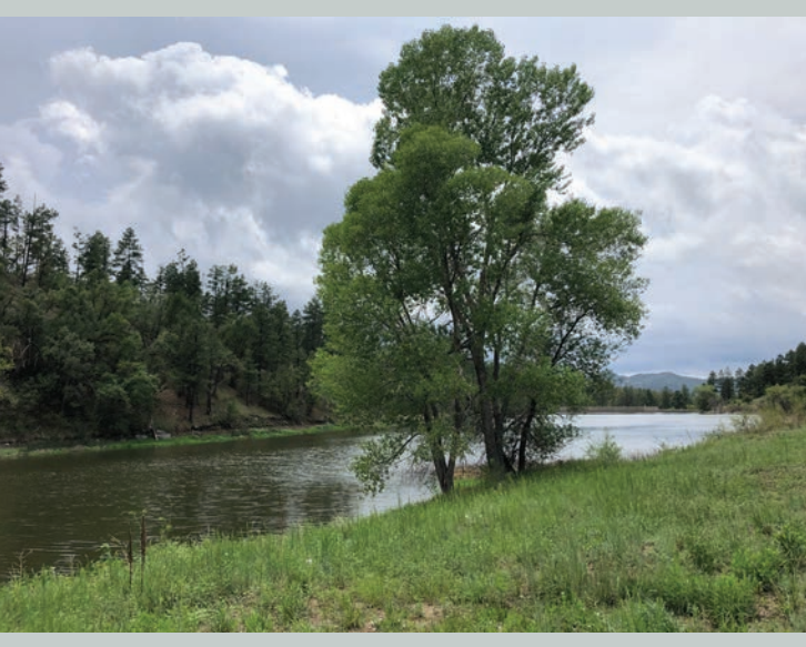
Lower Goldwater Lake

As part of the future expansion of day use facilities at Lower Goldwater Lake, which is currently slated to begin in fall of 2021, a new full loop trail around both lakes has been constructed. This trail offers a 2.4 mile loop along the shores of the Upper and Lower Lake. It's an alpine lake with a mostly shaded path that offers sweeping views and opportunities to stop and enjoy the lakeside people watching along the way since it's popular for fishing and kayaking as well as the trails. The lakes are named for Morris Goldwater (Barry Goldwater's uncle) for his civic service to the Prescott area over the years. The dams constructed in the early 1930s, were a New Deal Works Progress Administration (WPA) project. You can also see remnants of the old water pipe that took water from the reservoirs down Banning Creek and into the old south reservoir that used to sit above Mount Vernon Ave along Senator Highway.