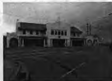
Santa Fe Depot Before Renovation - South Elevation

The Prescott Preservation Commission has review responsibilities for the Santa Fe Depot Historic District. The review process is required for any project requiring a building permit. Applicants are encouraged to meet with the City's Preservation Specialist prior to submission to answer any questions and obtain assistance in designing a historically compatible project.