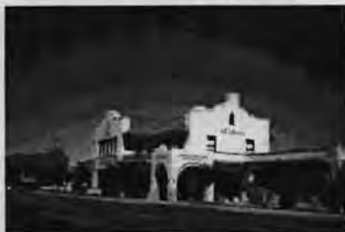
Santa Fe Depot After Renovation - View to Northwest

The Santa Fe Depot is a symmetrical two story building constructed of plastered reinforced concrete and measuring 100 feet (east to west) by 35 feet (north to south). An interesting example of the Mission Revival style, the building features a medium sloped gabled roof with mission tile and stepped curvilinear gable parapets with concrete caps. A 12 foot wide covered veranda with a concrete walk extends completely around the building. Arched portals with cast accents are present at each of the four corners. The cross gable projects north five feet and south 12 feet and is topped by the stepped curvilinear parapets. These projections emphasize the two main entries (track side and street side). A one story wing measuring 20 feet by 34 feet extends to the east. This was once terminated by a 40 foot high smoke stack which has been demolished.