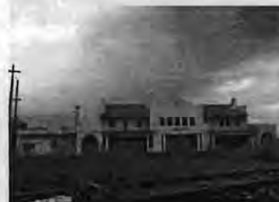
Santa Fe Depot Before Renovation - North Elevation; Railroad Tracks in Foreground