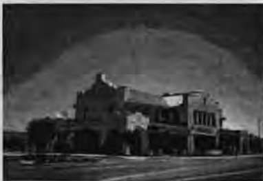
Santa Fe Depot, 1910 and Today